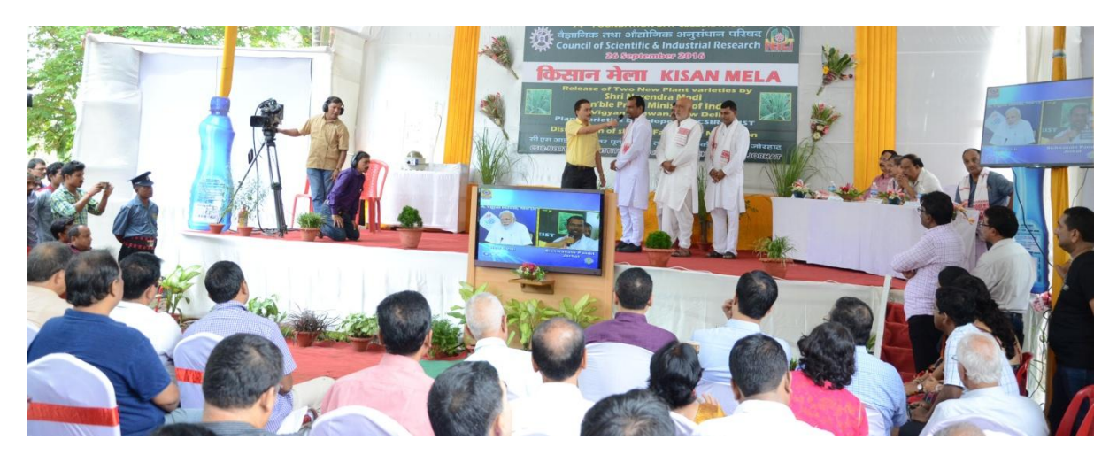
Interactive session of the farmers at CSIR-NEIST experimental farm with Hon'ble PM through Doordarshan live telecast.